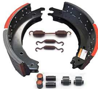
MERITOR KIT # 4707QH20 $ 38.69