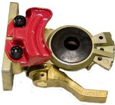
SLOAN # 441014 shut off Gladehand $30.96