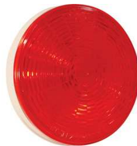
GROTE LED # 54342 $ 10.95 REG. # 42922 $ 1.99