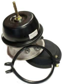
MADE IN USA 3030K-HDA $ 38.99

Wheel Seals Hub Caps Hub Meters Bearing Kits Pro Torq nuts Dually Drain Pan & No ream Kaiser King Pin Kits