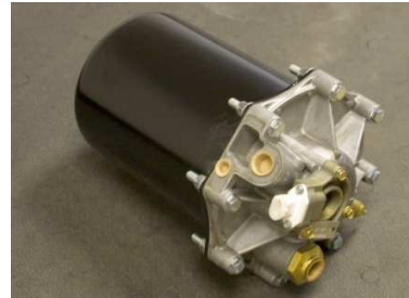
HDA WAP22-009 $ 169.00