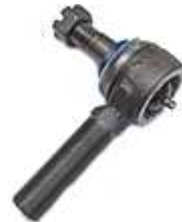
DAYTON 310-228 E4617, ES431L $ 31.33