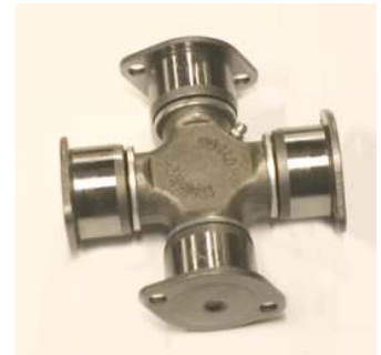
HDA # 5-675XR $ 31.11