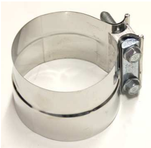
20A-500 $ 8.16 20S-500 $ 9.70