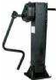
DAYTON BATCO Complete set # 11-0050 $ 322.35