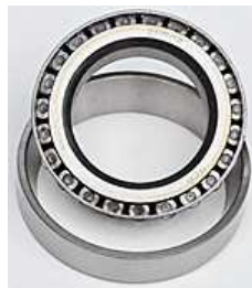
STEMCO SET 413 $ 33.11