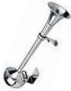
WAL1024 $ 45.52